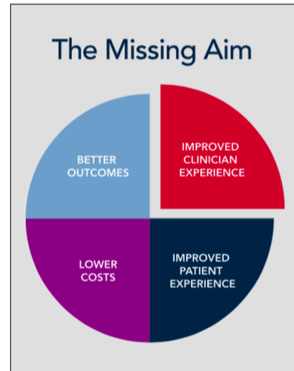
Figure 2. The Fourth (missing) Aim is improved clinician experience.